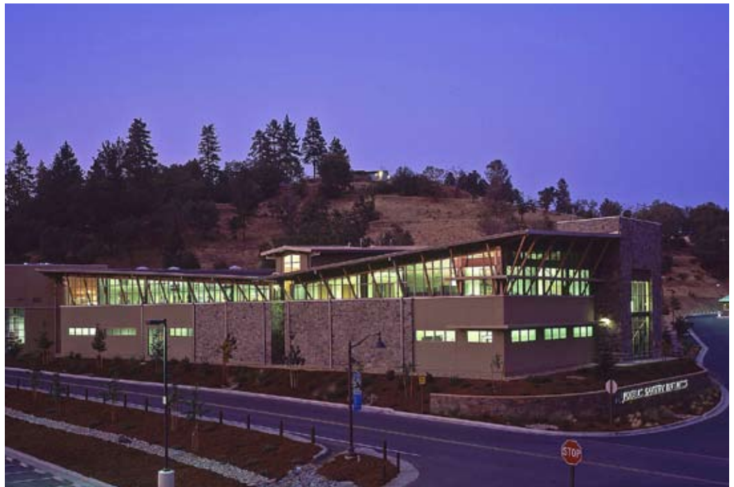
The Jackson Rancheria Public Safety Building is the first Native American Building to achieve LEED Silver Certification in California.