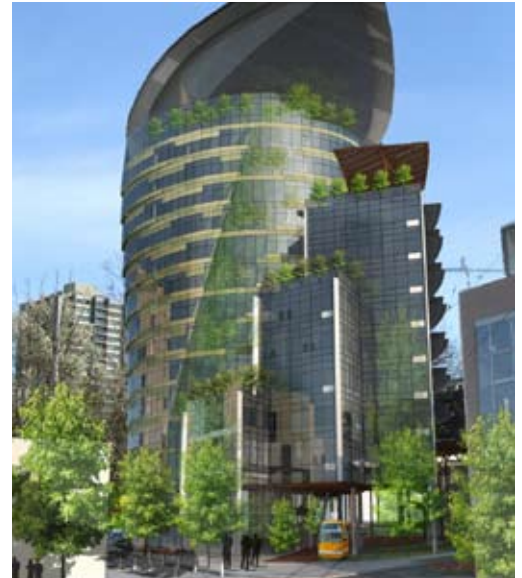
Interface Engineering is the lead mechanical, electrical and plumbing engineer for this project.